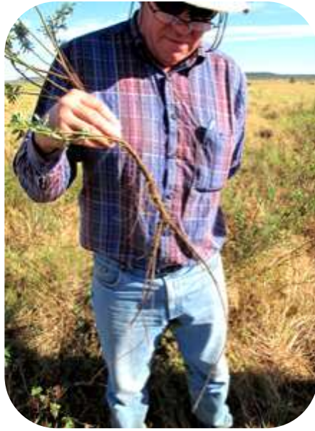
Long tap root - Drought tolerant