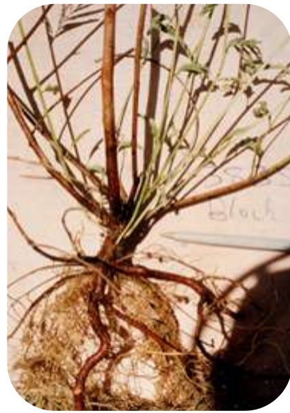
Growing tip below soil level - Grazing, frost, and fire tolerant