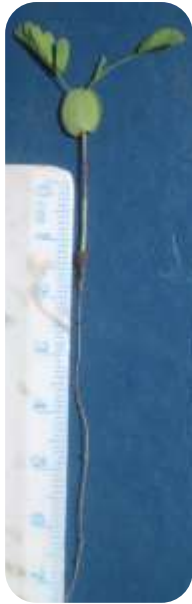
Seedling with moisture seeking taproot