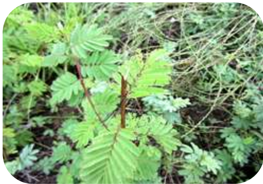
Palatable nutritious stem (12% CP), easily managed by grazing