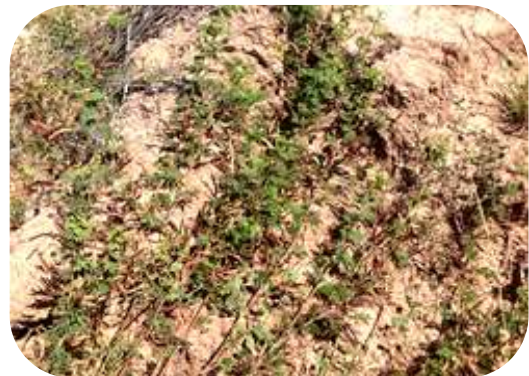
Heavy seed set, even during drought, provides long term persistence